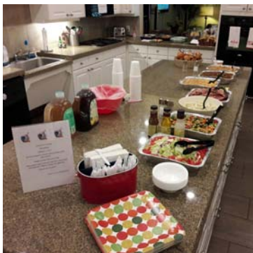
TTWC members put out a beautiful spread at the Fisher House in Feb. 2017, let's do it again Feb. 7, 2018!