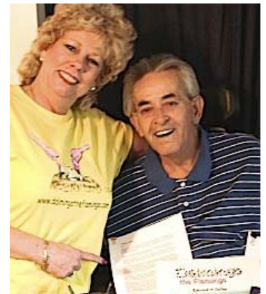
TTWC sent a donation to Wreaths Across America in memory of Edmund Gatley.