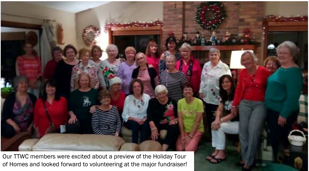
Our TTWC members were excited about a preview of the Holiday Tour of Homes and looked forward to volunteering at the major fundraiser!